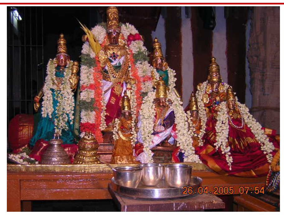
"Prahlaadavaradan in full Alankaram"

Satyam VidhAthum nija bhruthya bhaashitham vyaapthimcha bhoothEshvakhilEshuchAthmana: adhrusyathAdhadhbutha roopamudhvahan sthambEh sabhAyAm na Mrugam na Maanusham.